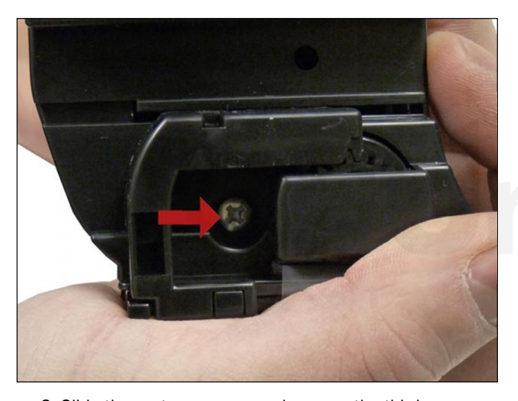
Slide the port cover over and remove the third screw.Remove the end cap.