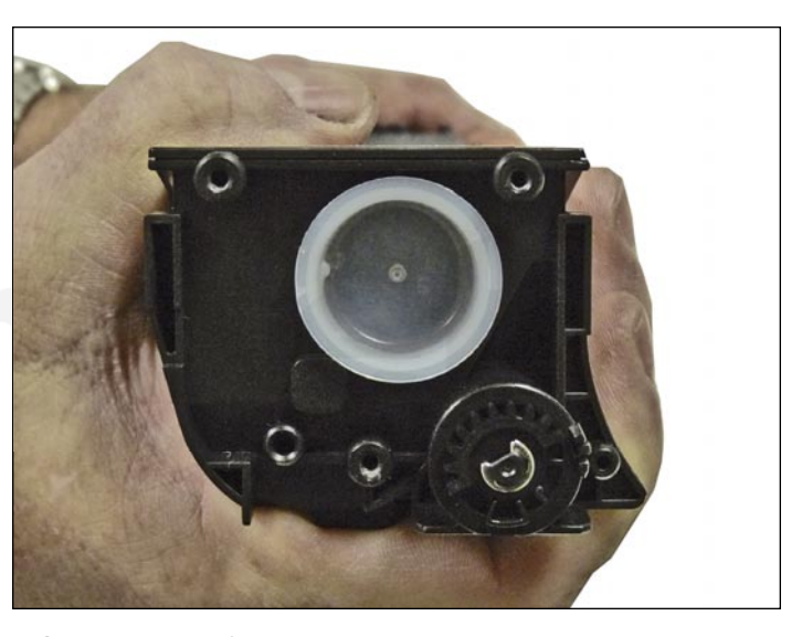
4. Remove the fill plug and clean out any remaining toner.

This fill plug is very soft. Be careful not to put a hole in it.