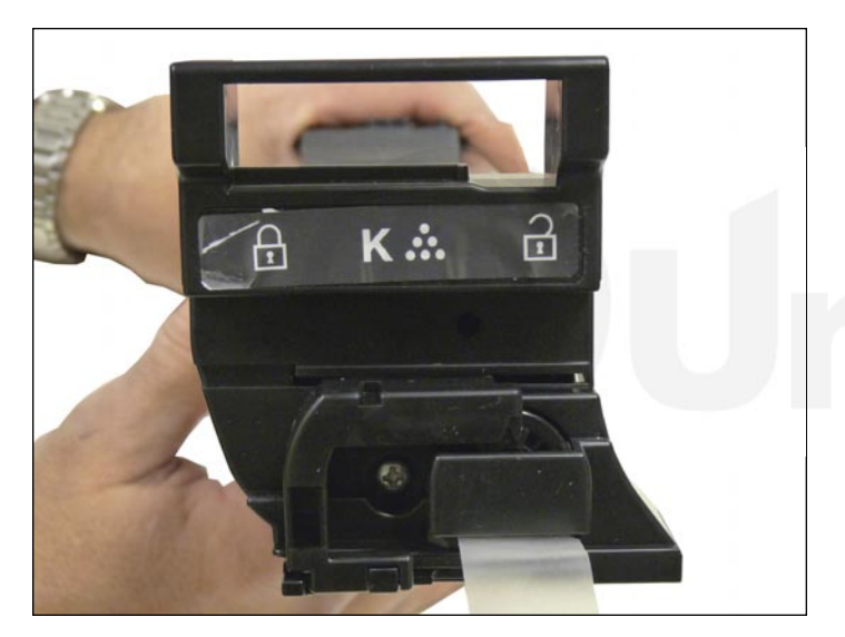
8. Install the three screws and install the label.

If a seal was installed, thread it through the slot. Set the port drive gear as shown and make sure it meshes properly.