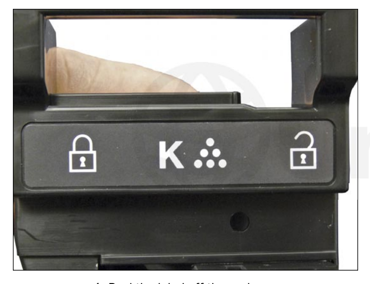
1. Peel the label off the end cap.

The Konica Minolta Magicolor 4600 Series cartridges are rated for 8,000 pages. The OEM numbers are A0DK132 Black, A0DK432 Cyan, A0DK332 Magenta, and A0DK232 Yellow. There is a chip that must be replaced every cycle.