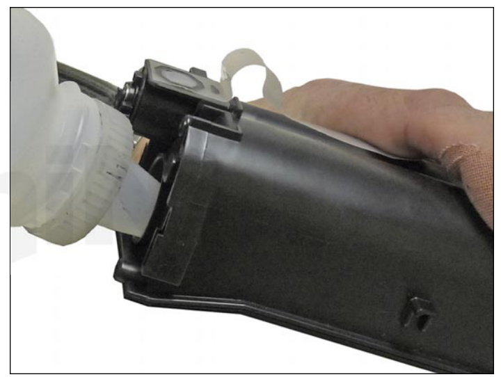
6. Turn the cartridge so the port opening is facing up and fill the cartridge with dedicated MC 4600 color toner. Replace the fill plug.