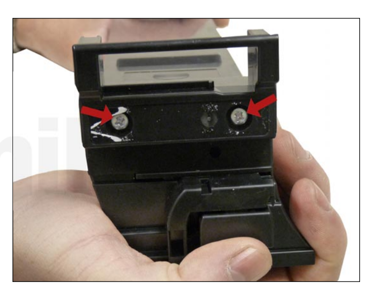
2. Remove the two screws.