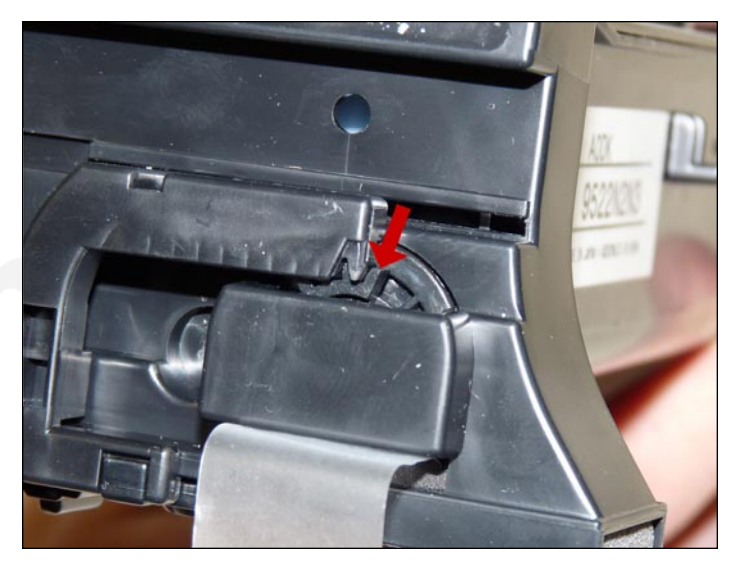
7. Install the end cap on the cartridge.

If a seal was installed, thread it through the slot. Set the port drive gear as shown and make sure it meshes properly.