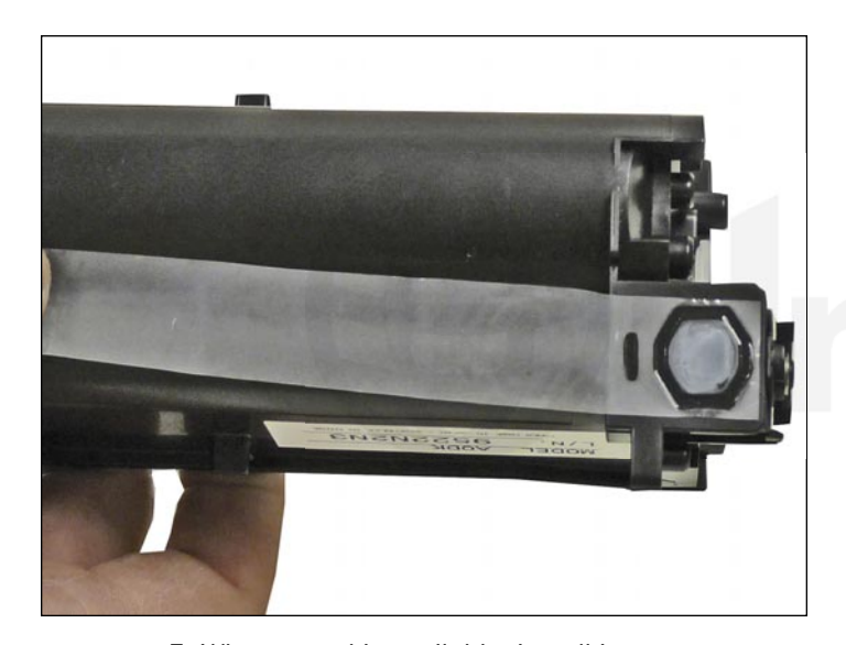
5. When a seal is available, install it now.

This fill plug is very soft. Be careful not to put a hole in it.