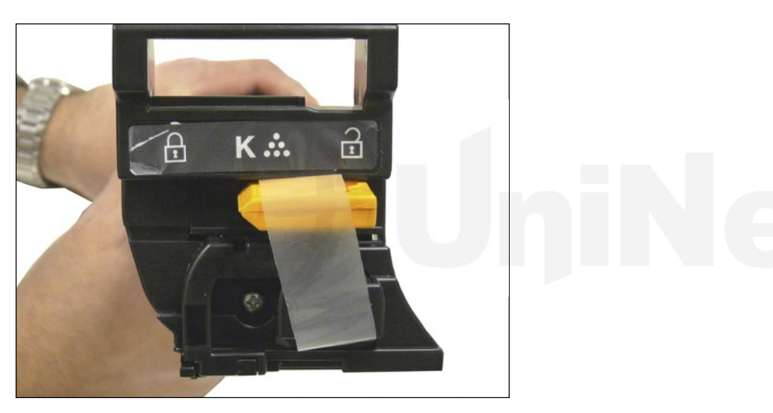
10. If a seal tab is available, install it on the seal and insert it into the cartridge as shown.